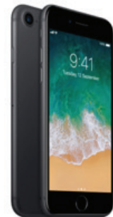
iPhone 7 - 32GB