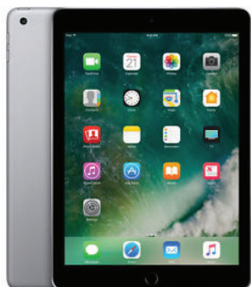
iPad 9.7" Wi-Fi 32GB