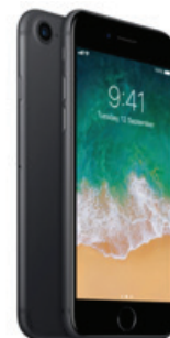
iPhone 7 - 32GB