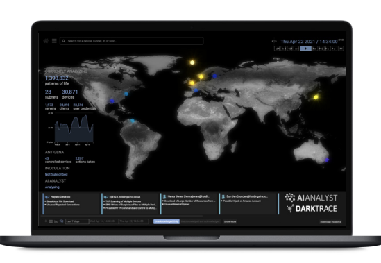
Figure 1: Darktrace provides complete visibility across the digital estate in real time

More than 5,000 organizations in over 100 countries rely on Self-Learning AI to protect their digital ecosystem, including cloud and SaaS, corporate networks and IoT, Operational Technologies and ICS, and email.