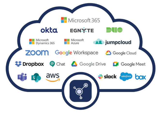
Figure 3: Darktrace's AI detects and responds to threats across the full range of cloud infrastructure and applications