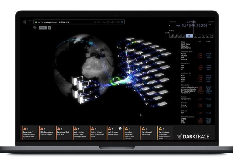
Figure 2: Self-Learning Al autonomously detecting a zero-day ransomware attack and stopping it in seconds

Conversely, Self-Learning AI is able to surface in-flight attacks that other tools miss and then take the right action, at the right time, to interrupt that attack, significantly reducing the overall risk of the organization as well as complementing existing security investments.